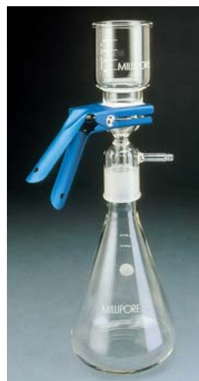
Figure 2. Filtration apparatus

A 100-mL sample volume is filtered at low suction pressure. Larger filtrate volumes may lead to increased cake filtration, particularly at high particle concentration, and may thus overestimate filtration performance. The filtrate is withdrawn from the filtration flask and analysed for turbidity, evt. other suitable parameters.